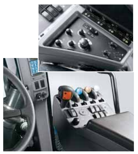
Right at hand ... controls for AutoShift<sup>TM</sup> hydraulic remotes, flow and timer, diff lock, hitch, custom headland management, optional slip limit, throttle and gear selection are integrated into the armrest for ready, comfortable access.